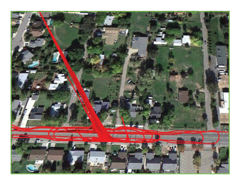
Figure 2. Picarro system visualization output used to locate a leak.

leak indication was investigated on foot as well, and confirmed 100% gas was venting out of a hole on the side of the street. Within minutes, Picarro source discrimination capabilities confirmed this to be natural gas (not sewer gas or other methane source). Once the gas had a chance to vent, the Picarro system was used to pinpoint the most likely leak location. The crew found the leak precisely where Picarro had indicated and was able to find and fix the leak.