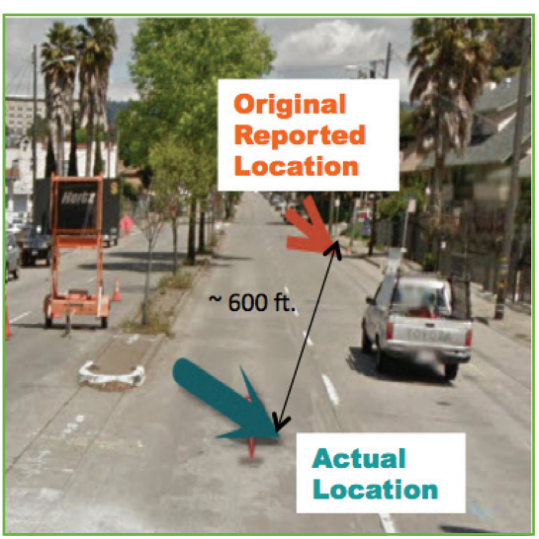
Figure 3. Picarro leak indications and leak location.